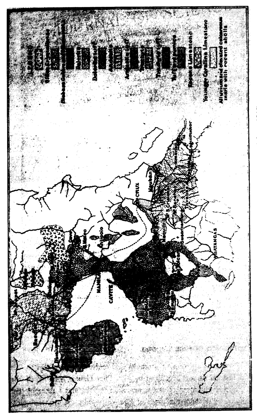
Figure 1. Sketch of the Tupaceous Area of Taal Volcano as Mapped by Centeno (Adams 1910)